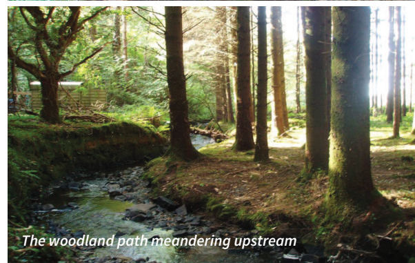
The woodland path meandering upstream